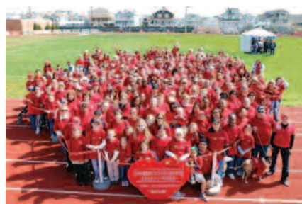
AtlantiCare's team takes first place organizing more than 550 walkers for the American Heart Association Heart Walk