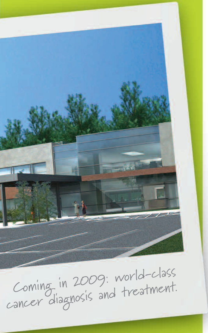
Coming in 2009: world-class cancer diagnosis and treatment.